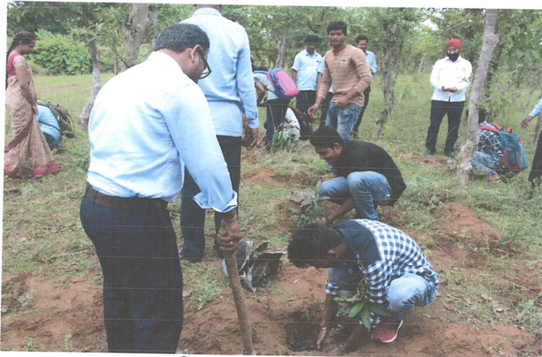
Students planting saplings