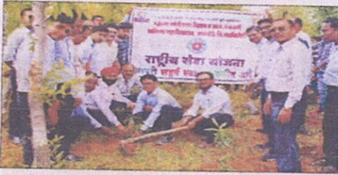
Students and others during the plantation drive.

BOTANY Department of Mahatma Gandhi Arts, Science and Commerce College, Armori, and National Service Scheme