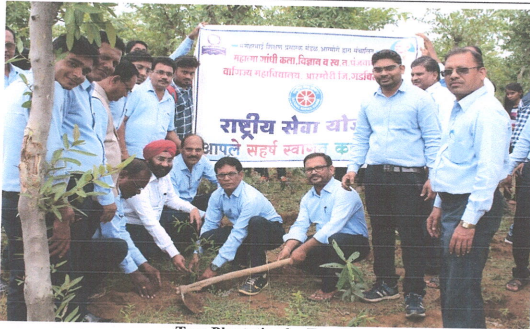
Tree Plantation by Faculty

There are 100 NSS volunteers participated in such inspiring novel activity and learned the lesson about importance of trees. Trees contribute to their environment over long periods of time by providing oxygen, improving air quality, climate amelioration, conserving water, preserving soil, and supporting wildlife. Community got aware about importance of trees